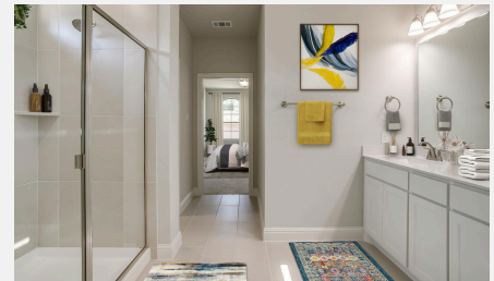
6819 Robert Reed Drive $359,990

Restrictions apply. See reverse for details