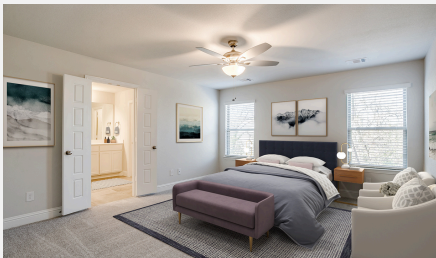
6804 Robert Reed Drive $339,990